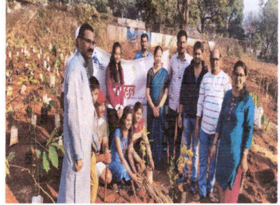
Tree plantation drive