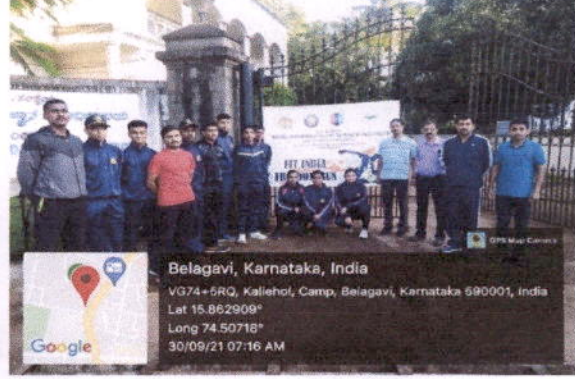
Fit India freedom Run