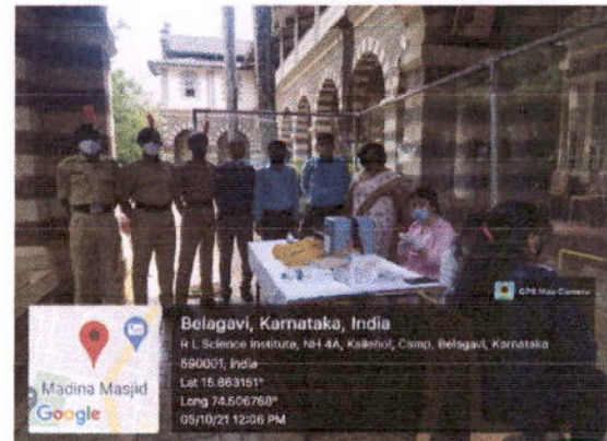
Covid Vaccine Drive